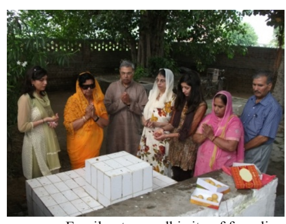
Family at samadhi site of founding ancestor